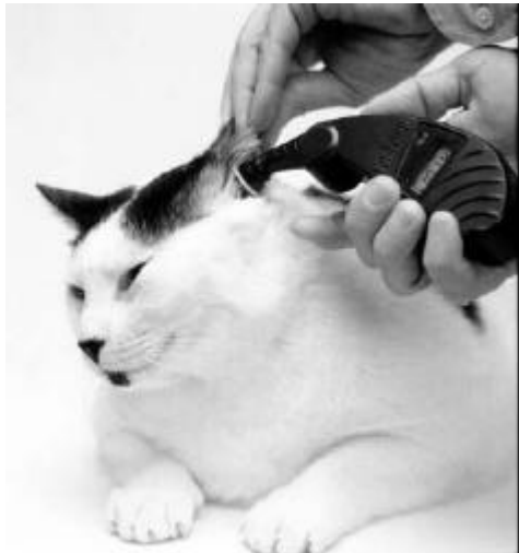
Fig. 1 Measuring temperature with Vet-Temp™ (model VT-100) instant ear thermometer

ear until it reaches the intersection of the vertical and horizontal canals. Measurement time is less than 1 second, signaled by a short audible beep. The device displays an adjusted temperature (rectal equivalent) which is +0.6°C (+1.0°F) over the blackbody setting. The calibration of the VT-100 was tested with a laboratory cavity-type blackbody having emissivity of 0.99 and temperature uncertainty of no greater than 0.03 °C. To compensate for the device calibration shift of +0.11 °C, the collected data were corrected by -0.11°C.